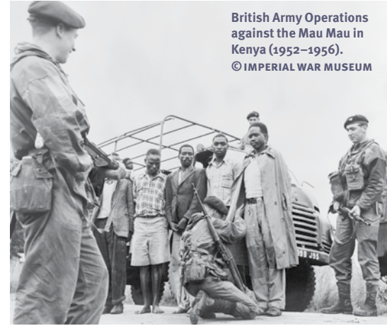
British Army Operations against the Mau Mau in Kenya (1952–1956).

to document the track record of counter-terror, stabilisation and statebuilding approaches around the world, attention to the lessons of the past is strikingly absent from the public debate on how to do better in future. This briefing calls for more analysis to examine why such shortcomings are repeated from one decade to the next with diminishing public scrutiny.