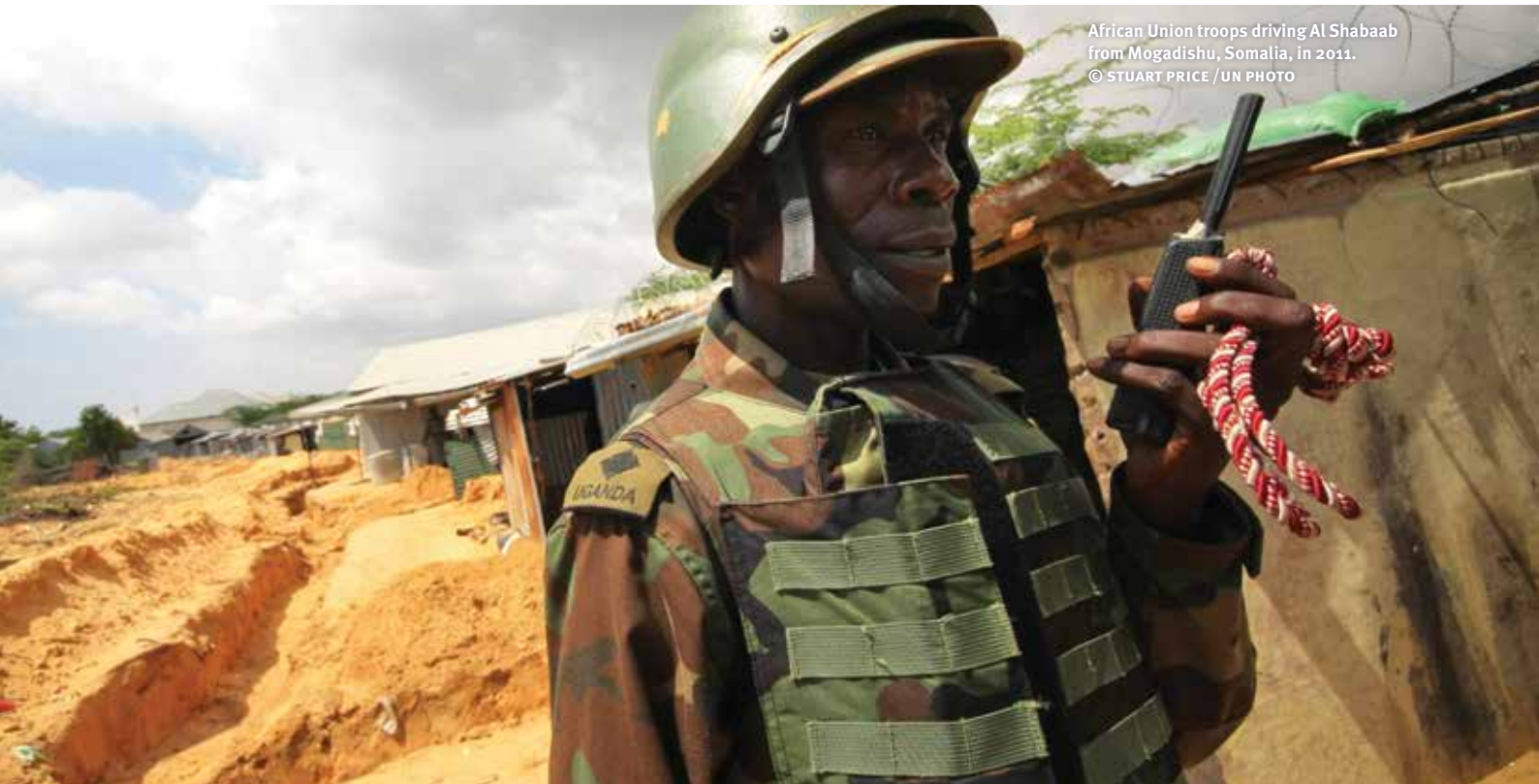
African Union troops driving Al Shabaab from Mogadishu, Somalia, in 2011.