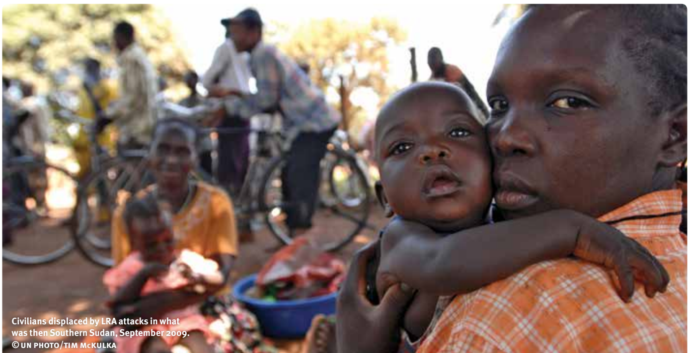
Civilians displaced by LRA attacks in what was then Southern Sudan, September 2009.

Significant efforts are also needed to strengthen adherence to international humanitarian and human rights law by international actors and those they co-operate with: torture and indiscriminate use of violence are not only wrong in principle – they also deepen the grievances that can fuel violence and make sustainable peace much harder to achieve. Demonstrating full accountability for irresponsible use of force and abuses that have taken place is vital to minimise grievances.