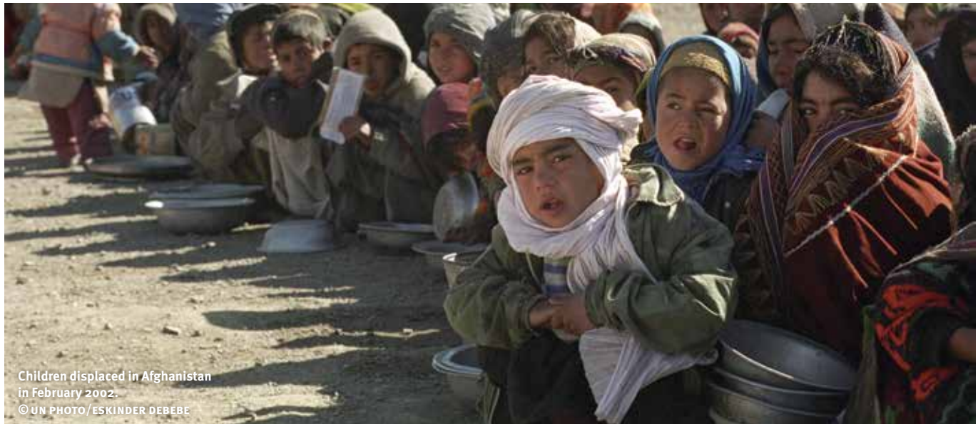
Children displaced in Afghanistan in February 2002. © UN PHOTO/ESKINDER DEBEBE

PHOTO CREDITS P.5 FROM TOP TO BOTTOM: Wreckage of a car bomb in Mogadishu, Somalia © UN PHOTO/STUART PRICE · AMISOM troops in combat with Al Shabaab in Somalia, 2012 © UN PHOTO/STUART PRICE · Civilians seek shelter from violence in DRC, 2003 © EU/UN PHOTO · A Somali refugee in Ethiopia, 2011 © UN PHOTO/ESKINDER DEBEBE · Scene of a suicide attack on peacekeepers in Mali, 2013 © UN PHOTO/MARCO DORMINO